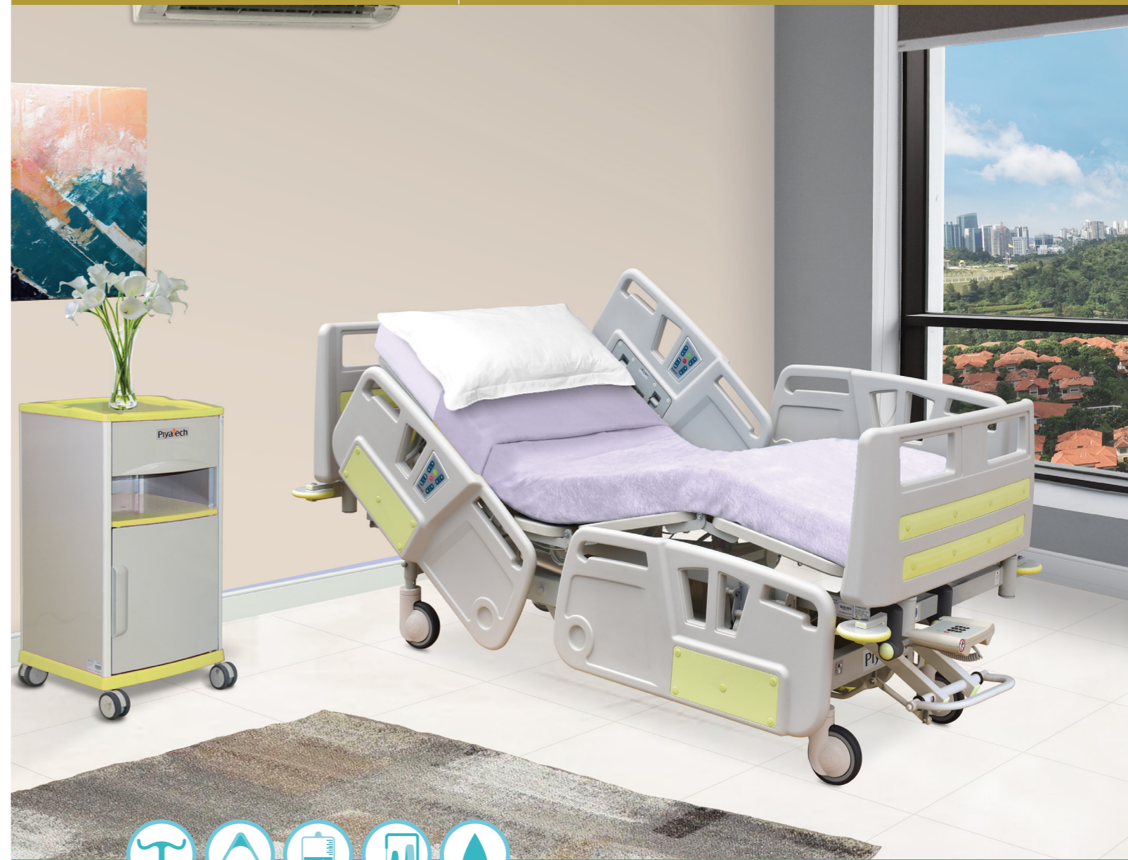
Piyatech 2023- 35000E V01 Validity Dec. 2024