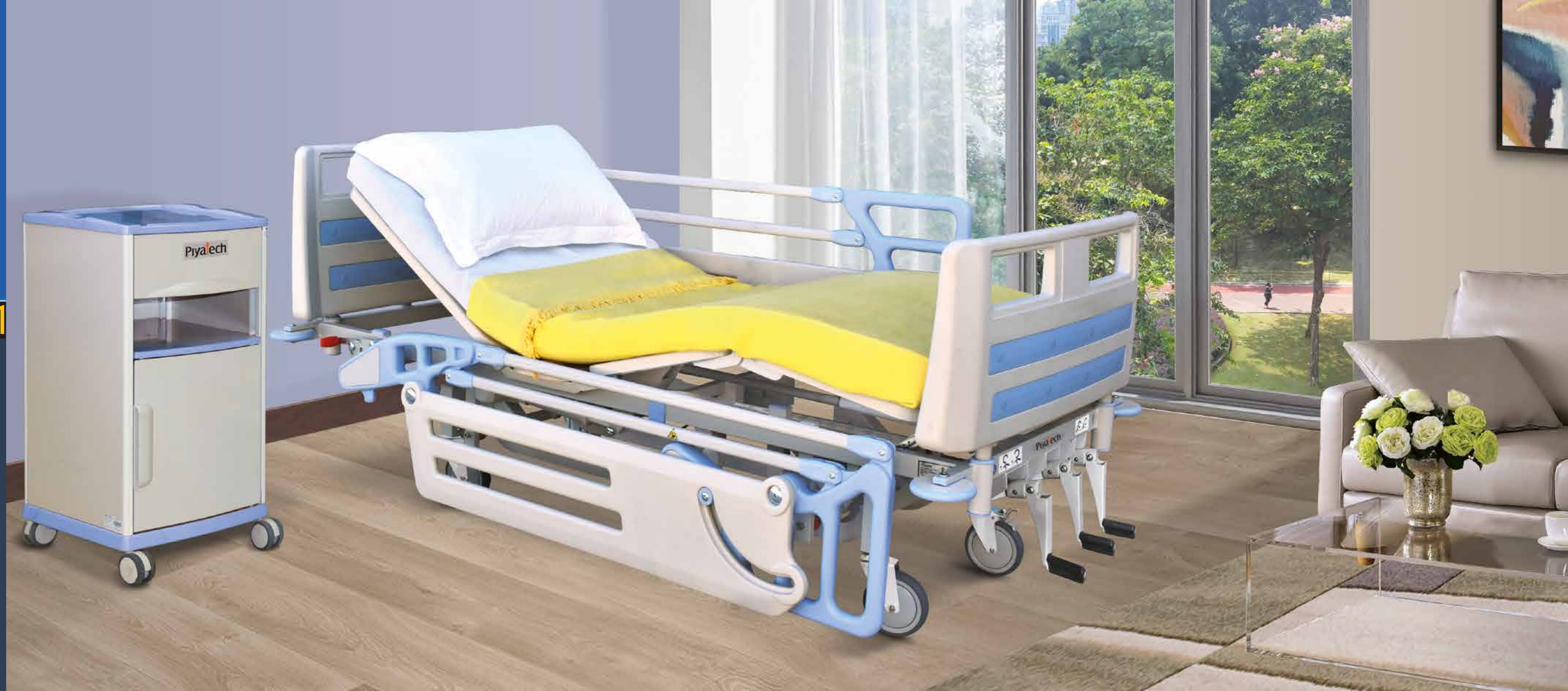
General Bed 35000MC1 Type 2