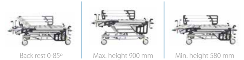
Back rest 0-85°