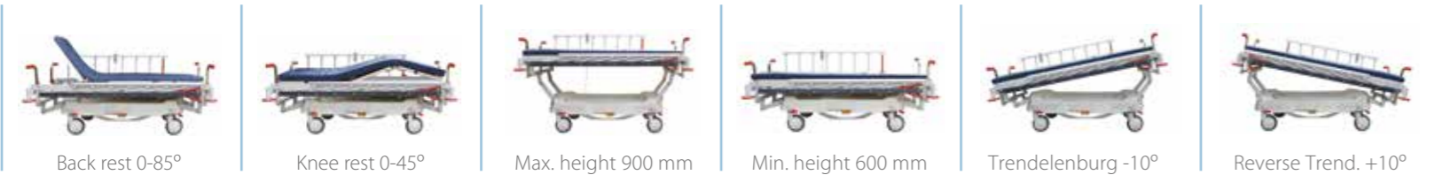
Back rest 0-85° Knee rest 0-45° Max. height 900 mm Min. height 600 mm Trendelenburg -10° Reverse Trend. +10°